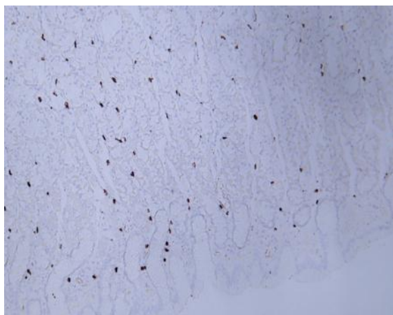
Human stomach tissue was stained with Anti-Mast Cell Tryptase (ABT-MCT) Antibody